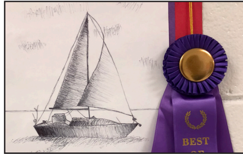
BEST OF SHOW WINNER "SAILING AROUND" BY CORBIN ANASTASIO