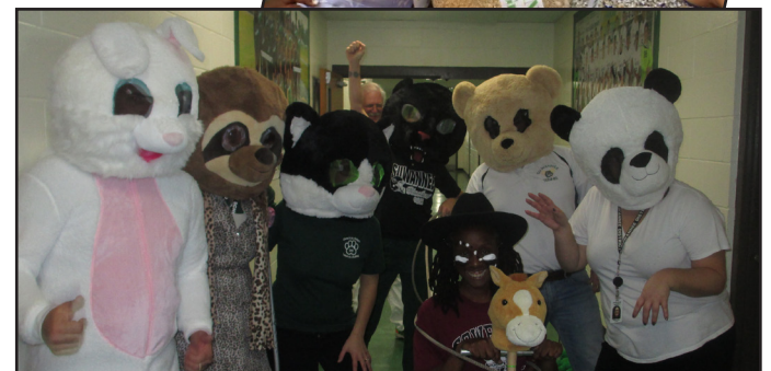
SMS TEACHERS AS THE ANIMAL BOBBLEHEADS DANCE CREW