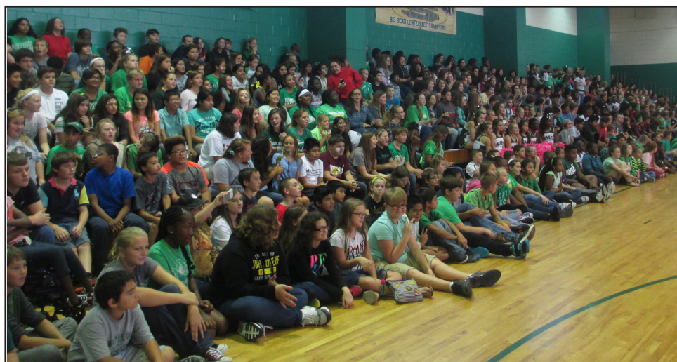
SMS STUDENTS ENJOY THE SMS HOMECOMING PEP RALLY

SMS Homecoming Week also featured the following Spirit Days: Movie Mania Monday, Time Travel Tuesday, Wacky Tacky Wednesday and Bullpup Spirit Thursday.