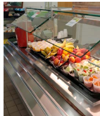
Multiple Choices of Fresh Fruits and Vegetables