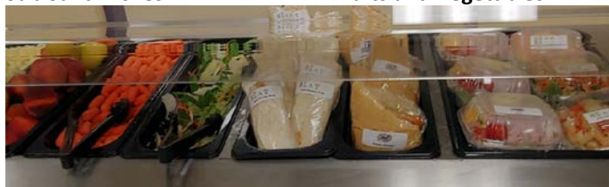
Grab and Go Sandwiches, Wraps, Salads, Fruits, Veggies