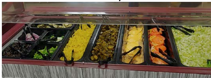
Help Yourself to the Burger, Dog, and Sandwich "Fixins"