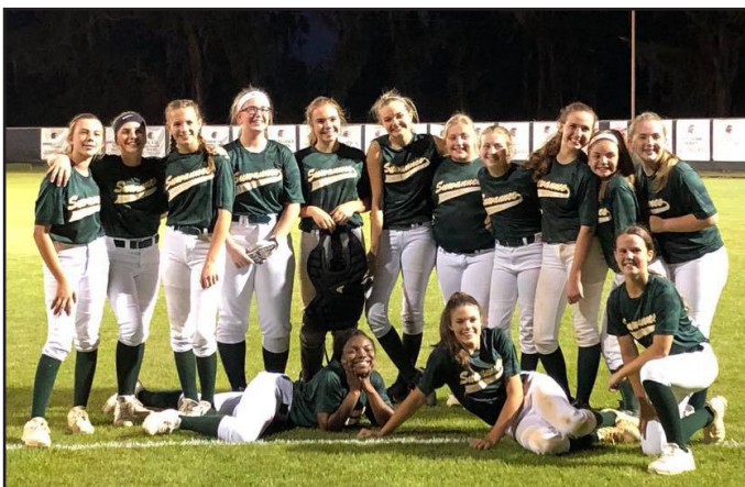
ABOVE: THE SMS LADY PUPS SOFTBALL TEAM WINS DISTRICT CHAMPIONSHIPS

The Lady Pups also overtook the Madison County softball team on April 3, winning their fourth district championship in a row, giving them an opportunity to play in the Big Bend