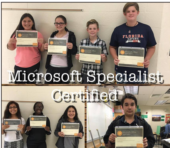
A FEW OF THE SMS CERTIFIED MICROSOFT SPECIALISTS